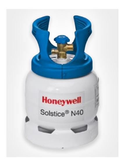
Honeywell's Solstice N40 (R-448A)

66R-448A is very easy to use as a retrofit with minimal system adjustment. 99